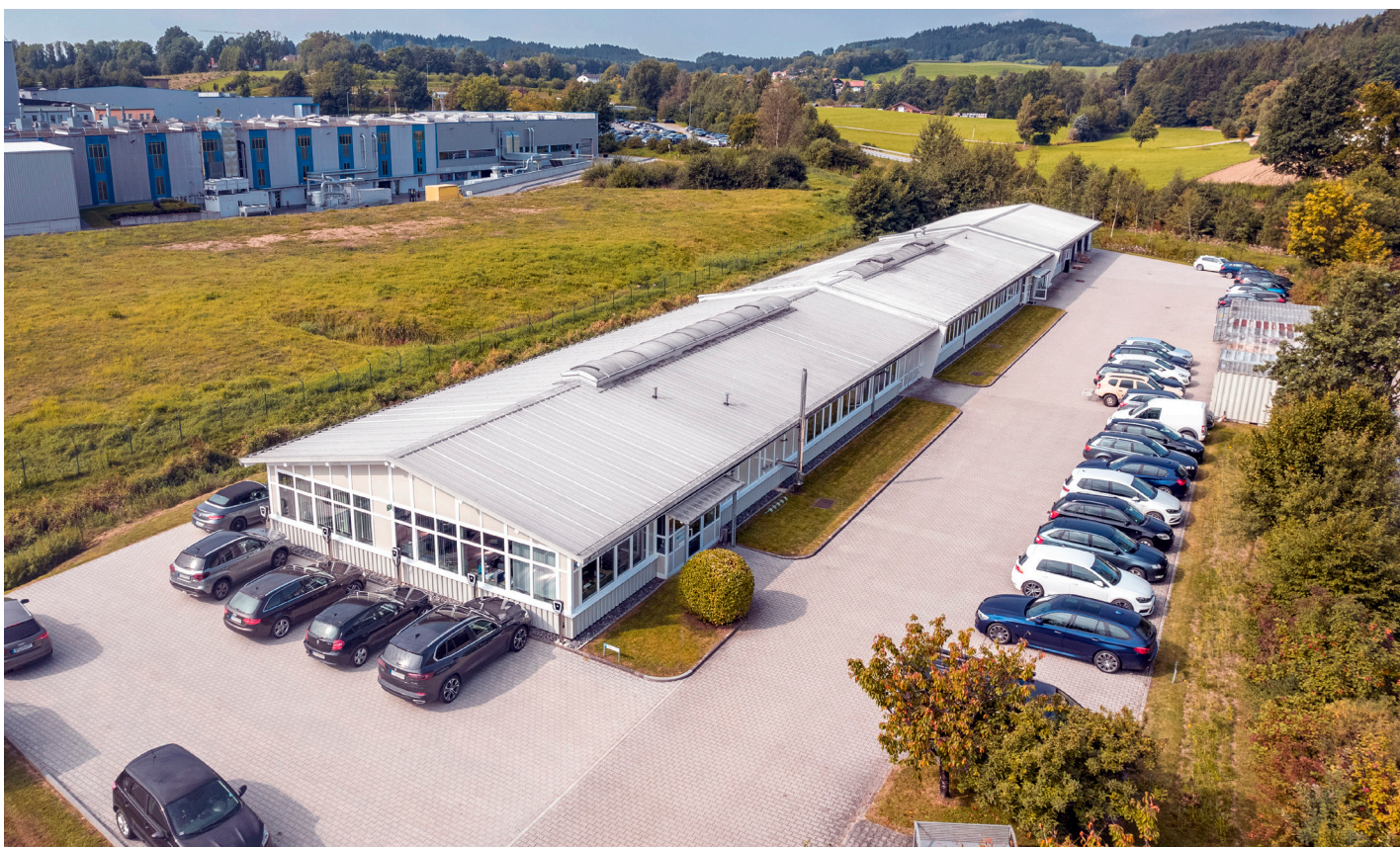
Short distances and ecologically efficient production: product development, production, service and support are all centralized here.

We have all the resources and the complete know-how to further develop our products in a targeted manner and to implement and support tailor-made special solutions for our customers with the necessary detailed knowledge.